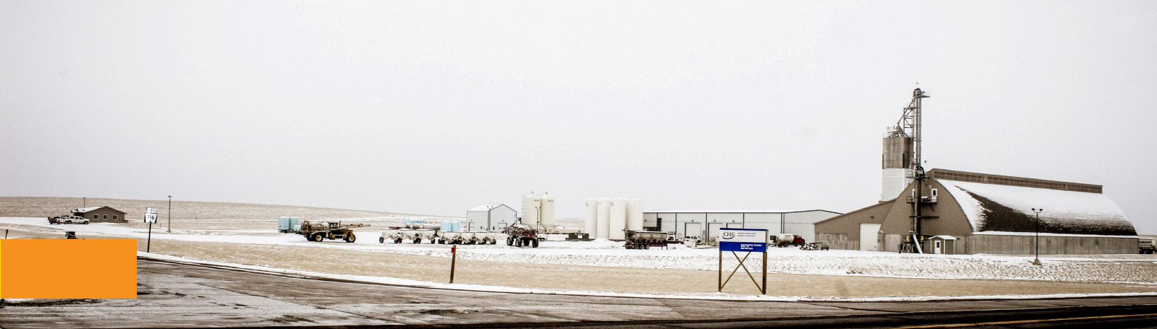
Dixon, Nebraska, location