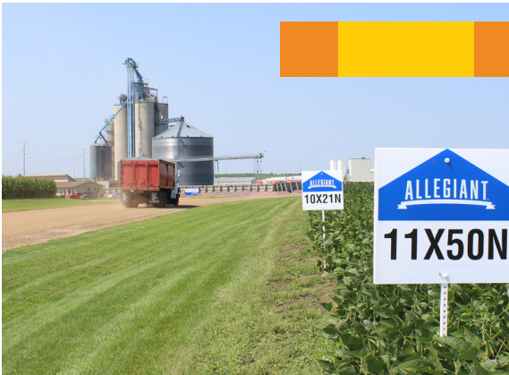
Brandon, South Dakota, location

It's all about our voice and how we can prepare the cooperative for the next generation.